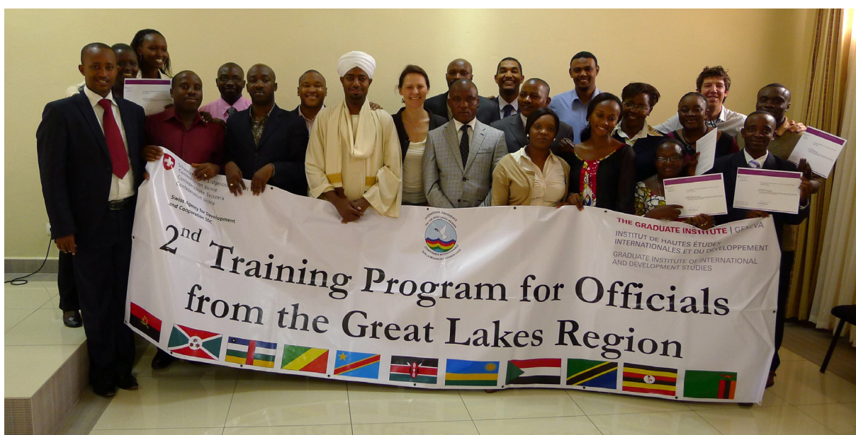
The participants from the second Training Programme in April 2012