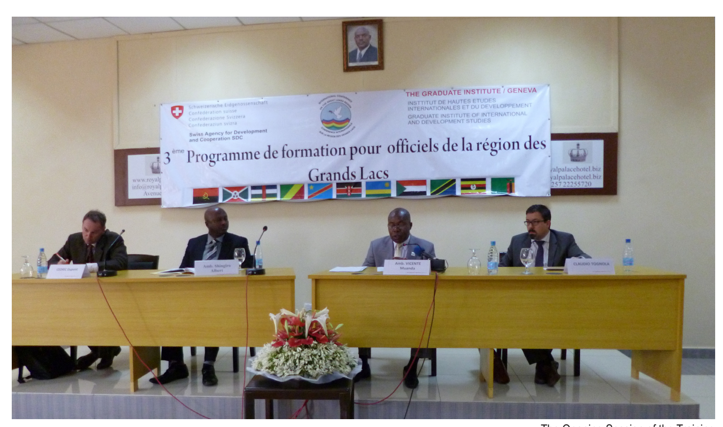
The Opening Session of the Training

Various social activities were part of the programme and an excursion to Karera-Gishora-Gitega-Teza allowed the participants to discover the host country. Hard work, lively discussions and fun made this edition of the Great Lakes training an unforgettable experience for everyone!