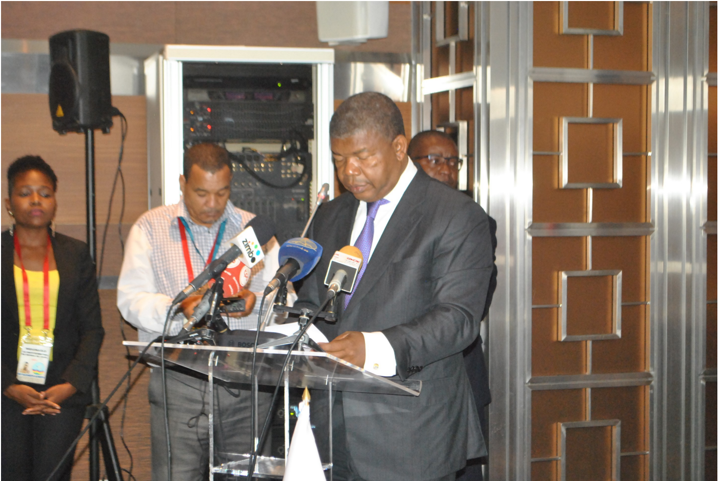
Gen. João Manuel Gonçalves Lourenço Ministers of Defence of the Republic of Angola and the Chair of the Committee of the Ministers of Defence

The Committee of the International Conference on the Great Lakes Region (ICGLR) Ministers of Defence held their ordinary meeting in Luanda, Angola, on 24 th May 2017 to review the security and humanitarian situation in the Great Lakes Region, particularly in the Eastern Democratic Republic of Congo (DRC), Republic of Burundi, Central African Republic, Republic of Sudan and Republic of South Sudan.