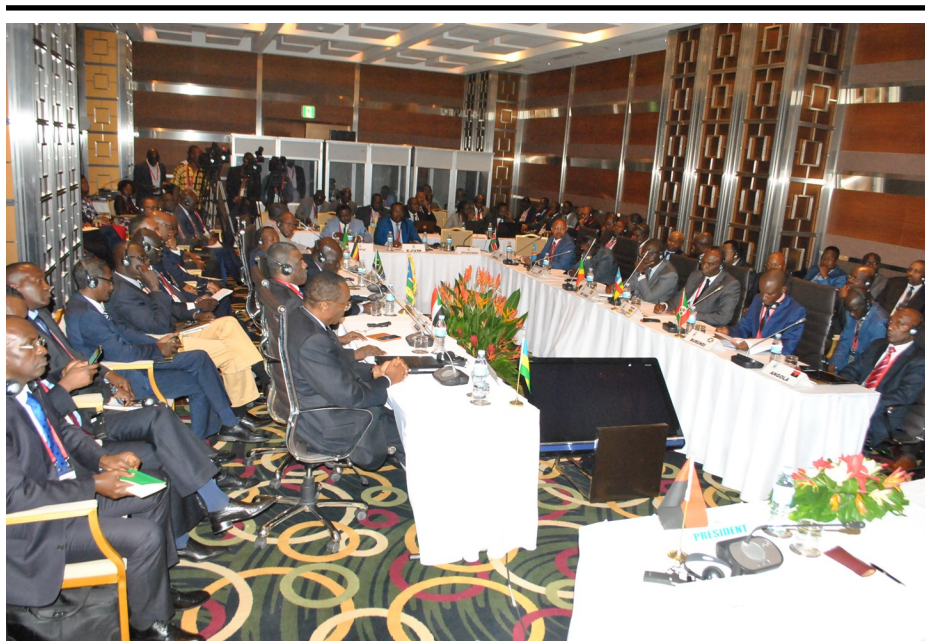
Cross section of ICGLR Minister of Defence and Representatives of Ministers

They encouraged the ICGLR Member states to support national dialogue in South Sudan as a means to finding a peaceful resolution to the crisis and