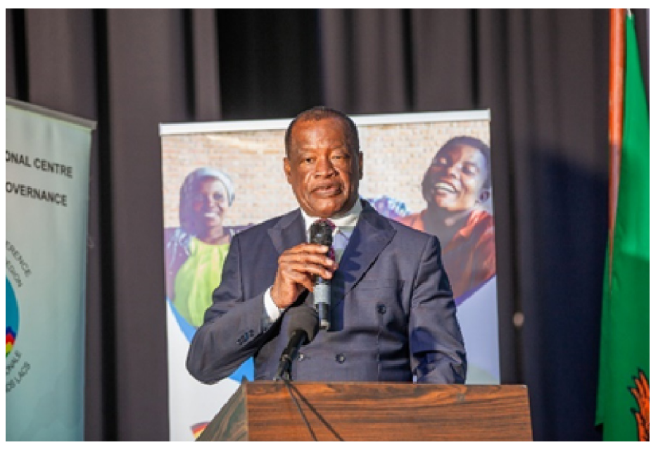
Honourable Jacob Jack Mwiimbu, Minister of Home Affairs and Internal Security Of the Republic of Zambia

"It is our conviction that this project will ultimately help to bridge the gap between grassroots organisations