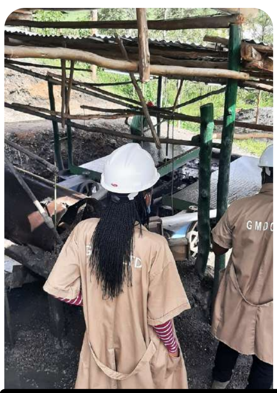
Visit of a processing plant as part of an ICGLR Third Party Audit.