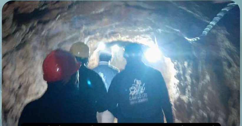
ICGLR Third Party Auditors visiting a mining tunnel in Rwanda

The ICGLR Regional Certification Mechanism (RCM) forms a core tool of the ICGLR Regional Initiative against the Illegal Exploitation of Natural Resources (RINR) and foresees compulsory tri-annual Third Party Audits (TPA) at each mineral exporter in the region managed by a tri-partite Audit Committee. Third Party Audits are key in order to maintain the credibility of the ICGLR Certificate which guarantees regional responsible mineral supply chains.