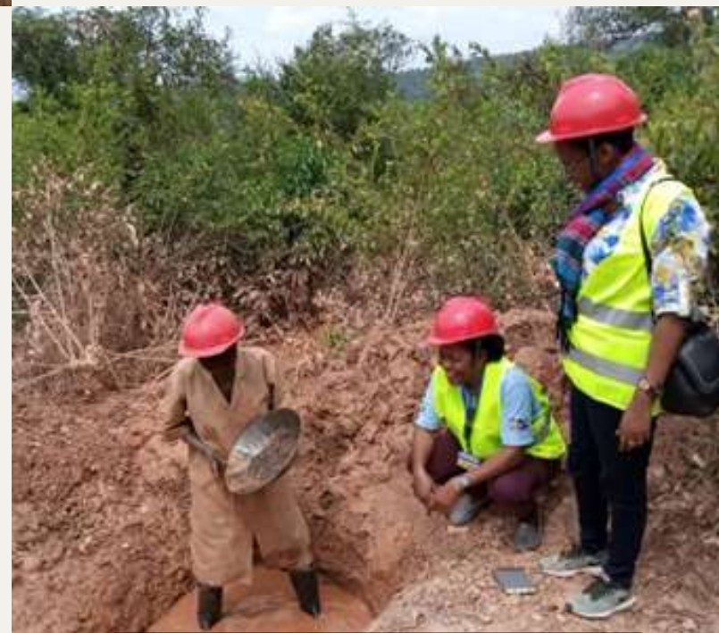
AFP sampling team surveying the Mpinga mine in Kirundo Province, Burundi

The AFP is designed as an optional proof of origin within the ICGLR RINR mineral certification framework of 3Ts and seeks to complement existing chain of custody systems to strengthen the integrity/credibility of the whole certification system. AFP tests are to reduce the inherent loopholes of chain of custody systems at the beginning of the supply chain, i.e., preventing minerals with falsely declared origin from entering the supply chain.